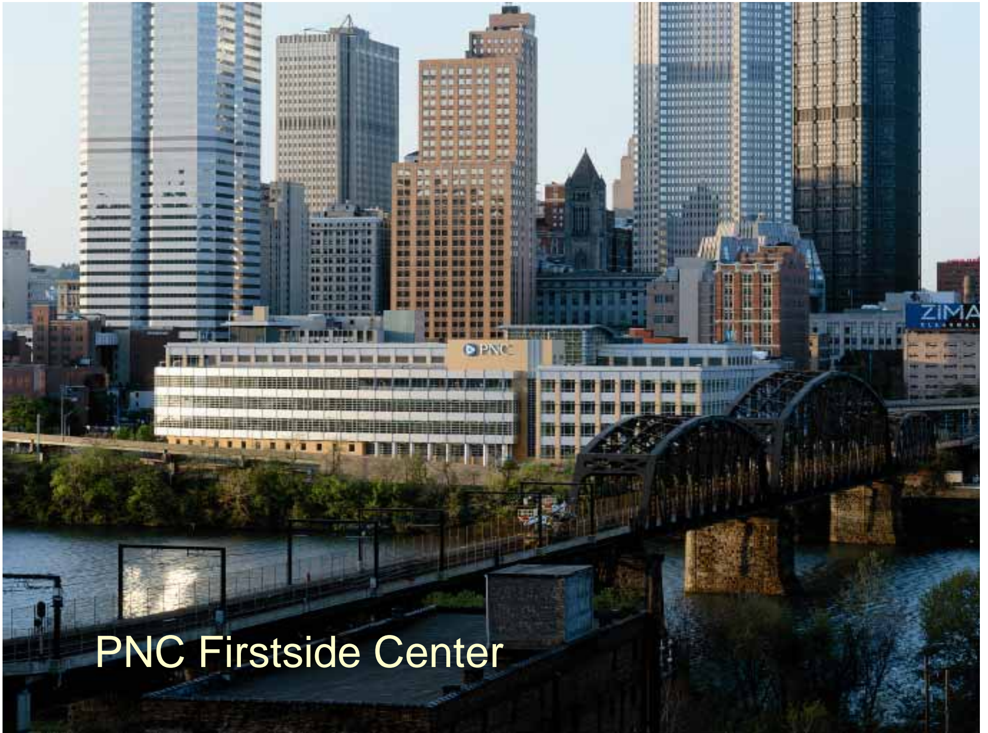
PNC Firstside Center